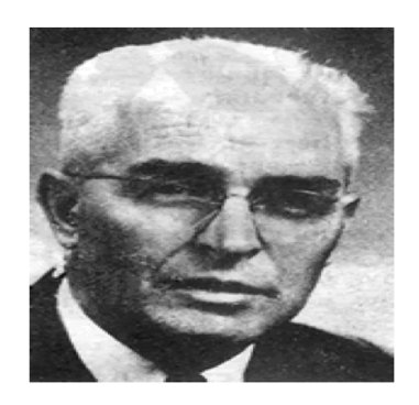
AND THE GENERAL CONFERENCE COMMITTEE OF SEVENTH-DAY ADVENTISTS